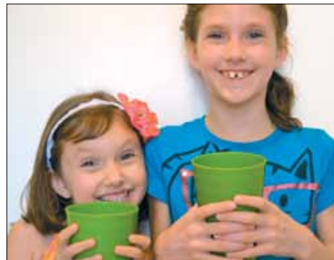
Proceeds from lemonade sales will bless Redeemer kids as they bless others.

center have either been trafficked or are at risk of being trafficked. The lemonade will be 50 cents per cup, so come prepared to bless these young people with your quarters and dollars on July 21. This is a tangible way to reach out with the love of Jesus to those in our community.