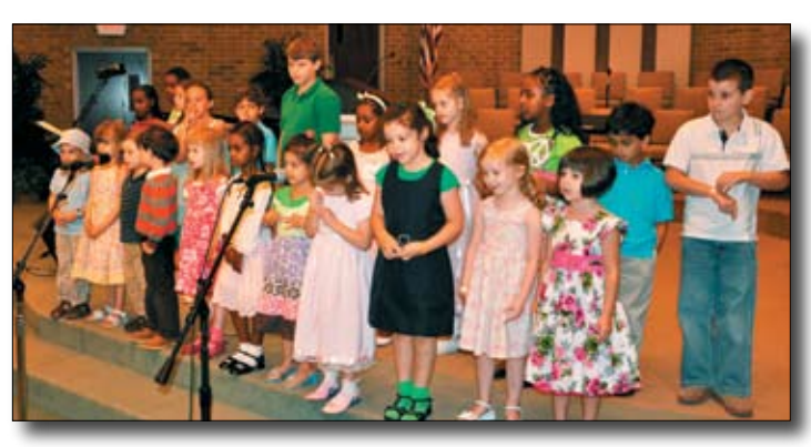
Sunday May 16, Pre-K through 5th graders recited memory verses they have been practicing all year! Way to go on hiding God's Word in your heart!

eat and play table games from 12 noon till 4 PM. Bring your own lunch and we will provide the games. Bring a parent, friend or neighbor.