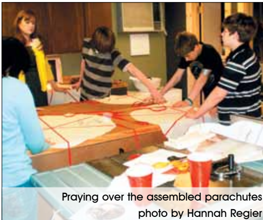
Praying over the assembled parachutes

On Missions Sunday, Redeemer's youth group assembled ten parachutes for Voice of the Martyrs.