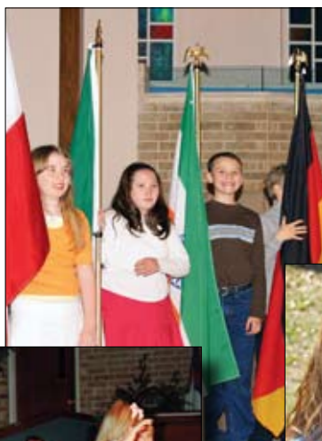
March 16: Missions Sunday