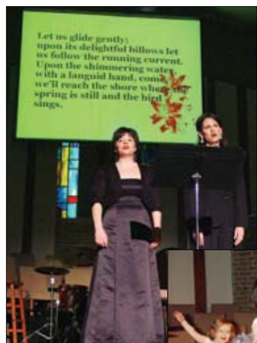
February 24: Variety Show