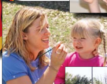
March 22: Easter Eggstravaganza