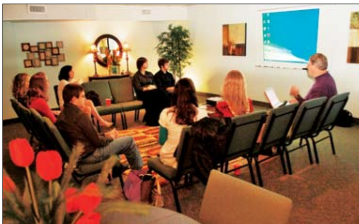
The College and Career Classroom