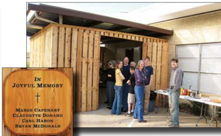
The Hamburger Harbor . If you can come up with a better name, we'll cook you a free hamburger.